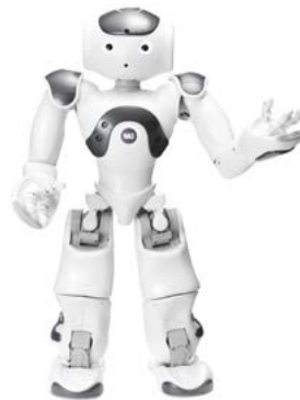
NAO-noBG.jpg| 1920x1920px © Softbank Robotics