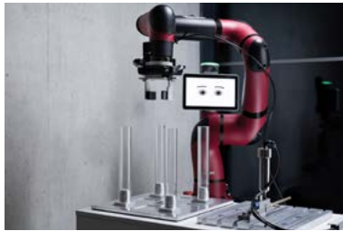
Sawyer-1.jpg | 1920x1080px