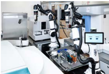
The_Box_Labor.jpg | 1920x1080px