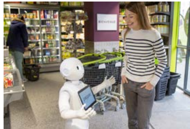
Pepper-Supermarket-woman.jpg | 1920x1080px