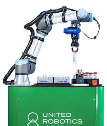
URG_RobSolutions_uMobileLab_noBG.jpg | 1080x1920px