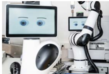
The_Box_Labor.jpg | 1920x1920px