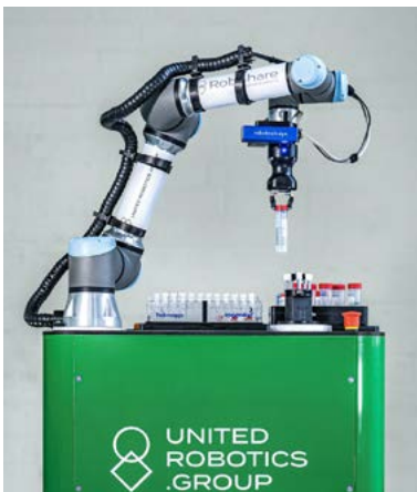
URG_RobSolutions_uMobileLab.jpg | 1080x1920px