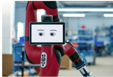
Sawyer-factory.jpg | 1920x1080px