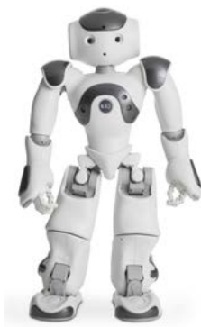
NAO-noBG-2.jpg| 1920x1920px