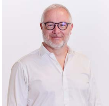
Xavier_Lacherade_Softbank_CEO.jpg | 1920x1920px